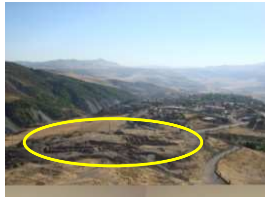
FIGURE 2: View of the site after the 2009 excavation

The archaeological vestiges discovered in Taza attest to the presence of several deposits (from the older to the most recent): Roman, Almohades and the Emir Abd-el-Kader level. The rich and exceptional materials discovered are under detailed study.