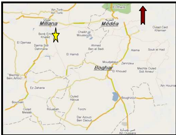
FIGURE1: Taza geographical localization

Taza site is situated at the south-east of Miliana (Fig. 1), on the mountain of Matmata. The Lambert coordinates of localization are X: 434-434.5, Y: 3968.5-3969. The settlement is one of the establishments (Bourouiba, 1983) founded by the Emir Abd-el-Kader 1 .