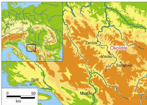
FIGURE 1. Area of research NE of Sarajevo.

To gain a better understanding of neolithic societies and their reception of the environment, anthracological investigations provide information about the wood use and the exploitation of woodland. The interdisciplinary PhD-project “Tells in the woods? - anthracological investigations in South-East Europe and Turkey” aims at tracing exploitation strategies for woodland vegetation developed by tell inhabiting societies and raises the question for the beginning of an intentional management of wooden resources.