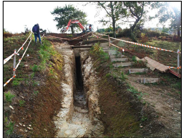
FIGURE 1. Arditurri 3, entrance of the tilted gallery.

making and 2) fuel for roasting the rocks in order to facilitate the extraction of the hardest veins.