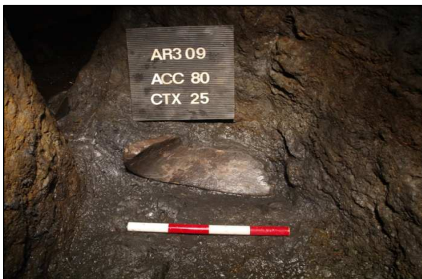
FIGURE 3. Shovel made of beech wood ( Fagus sylvatica ).

As we can see in Figure 4, the smaller fragments which are mostly preserved through charring show a higher diversity of taxa: Acer , Corylus avellana , Fagus sylvatica , Fraxinus , Ilex aquifolium , Quercus subg. Quercus , Quercus ilex/Q.coccifera , Salix , Ulmus , Rosaceae and Fabaceae. The best represented wood is beech ( Fagus sylvatica ) and the group of the deciduous oaks ( Quercus subg. Quercus ) although it is significant