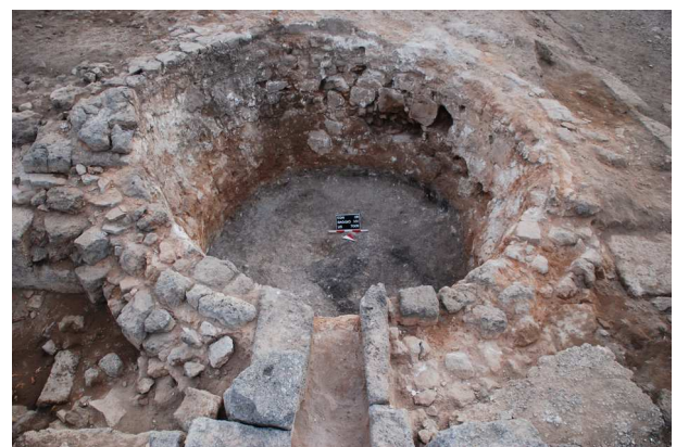
FIGURE 2. Lime kiln found in the area to the south of the basilica.

The lime kiln of Egnathia is located to the south of the Episcopal basilica (Fig. 2). The furnace was recovered filled with its original charge: calcareous stones and fuel. The furnace has a truncated cone shape and a diameter of about 3 meters.