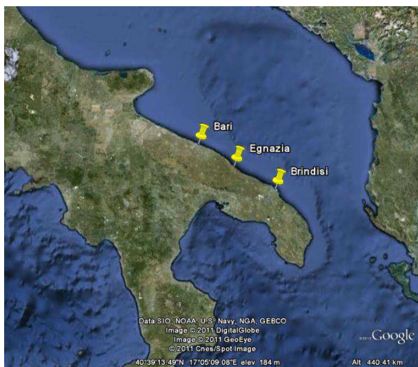
FIGURE 1. Location of Egnathia .

The site is settled on the Adriatic coast of Apulia region, on the border between Messapia and Peucezia ancient regions (Fig. 1). Its location favored a long anthropic history, from the Bronze Age (16th-15th century BC) till the medieval period (10th-15th century AD). In particular, Egnathia has played a central role in the trade between the Mediterranean Basin and the Apulian hinterland during the Roman period and the Late Antiquity.