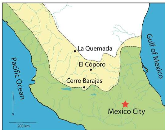
■ Extent of Mesoamerica between AD 200 - 900 ■ Extent of Mesoamerica at AD 1519 ● archaeological site