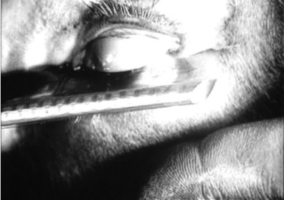
Figure 12.1 Woman's eye slit by a razor blade: the shocking prologue to Luis Buñuel's Un chien andalou (1929; prod. Pierre Schilzneck / María Portolés [Buñuel's mother]).

it a hybrid mix of Vertov's concepts of kino-pravda (film-truth) and kino-glaz (film-eye). Kamus' divinatory postulates are transcribed on intertitles: