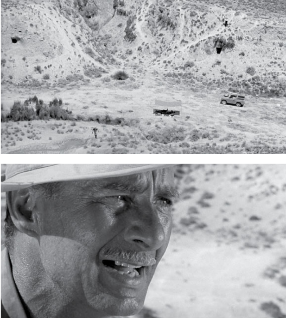
Figure 12.3 Sunburned landscape and faces as harbingers of tragedy in Carlos Saura's La caza (1965; prod. Elías Querejeta PC).

sequences, ideas, divertimentos. In other words, the whole film depends on the sets inasmuch as they are a metaphorical, narrative, and psychological projection of the demiurge that gives birth to it.