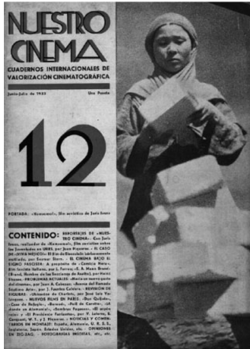
Figure 15.1 Nuestro Cinema (June–July 1933) featuring a still from Joris Ivens’ Konsomolsk (1932). Private collection.