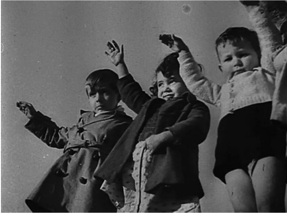
Figure 15.2 Children giving the fascist salute in the original version of Raza (José Luis Sáenz de Heredia, 1942; prod. Consejo de la Hispanidad), excised in the 1950 bowdlerized version. The original version was recently restored by Ferran Alberich for Filmoteca Española.

airbrush the early Franco regime's pro-fascist stance out of its film propaganda. After the fall of the Berlin Wall in 1989, when East and West German film archives were merged, a positive print of the original 1942 version was found in the former UFA archives in East Berlin. Thanks to collaboration between the Bundesarchiv and Filmoteca Española, the original version could be restored, revealing the exact changes to the original and thus providing an insight into Spain's repositioning of itself in the new Cold War climate after World War II (Alberich 1997).