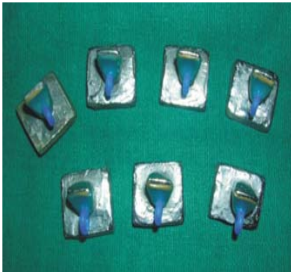
Fig. 3. Wax patterns fabricated using direct wax pattern technique directly over the metal dies.

wax pattern. Wax patterns were fabricated using direct wax pattern technique directly over the metal dies to avoid distortion during the removal of pattern from the die, which could induce errors in the thickness of the patterns (Fig. 3). An inverted U shaped wax loop was made up of 2mm round sprue wax which was attached on the palatal surface over the cingulum area, which would later serve as an attachment for loading on the universal testing machine.