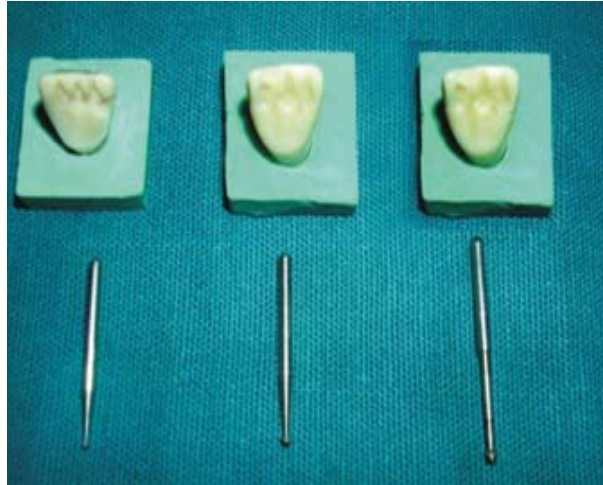
Fig. 1. The depth of preparation was kept with the help of depth orientation grooves made with 1mm and 0.7 mm bur.

Five maxillary central incisor Typhodont teeth (kulzer Germany) were used for the purpose of this study. Palatal surface of three central incisors were reduced 0.5mm in depth with the help of round bur. Preparation was extended proximally terminating just lingual to the facio-proximal line angle to increase the tooth surface area for bonding and to allow a definite path of insertion, almost