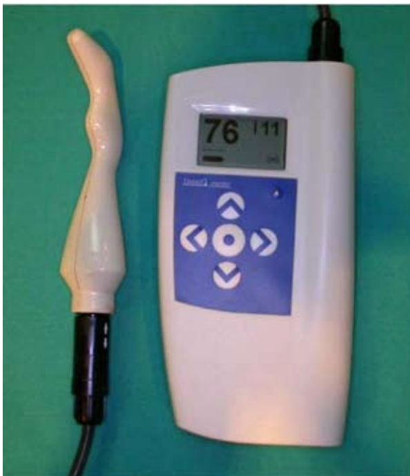
Fig. 3. An Osstell transducer

3.-Resonance Frequency Analysis: An Osstell frequency resonator was used (Integration Diagnostics, Goteborg, Sweden) (Fig. 3) with a 5-mm-high transducer abutment compatible with an external universal hexagon platform. Measurements were made after the initial implant placement and 5 weeks later. The implants were evaluated using the Implant Stability Quotient (ISQ), which is a scale from 1 to 100.