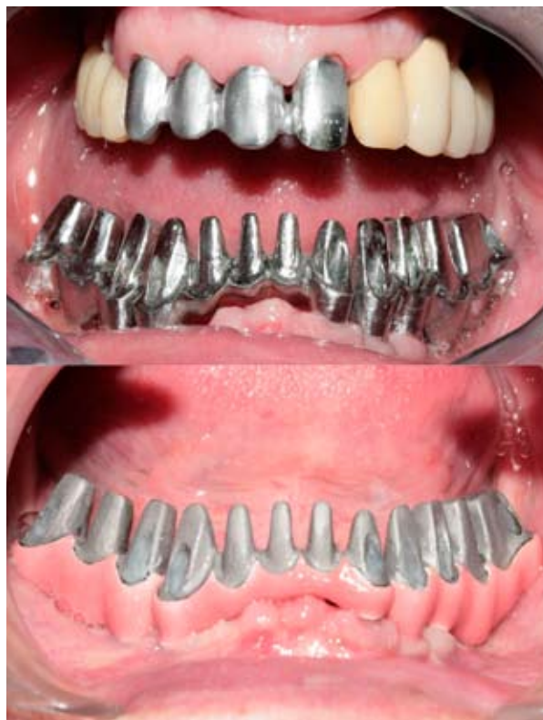
Fig. 1. Frontal view of the sectioned mesostructure with multiple individual abutments before and after the ceramization in pink to mimic the soft tissues.

All implants healed uneventfully, but a surgical bur was broken during drilling due to the bone strength at the level of 47. Moreover it was found that the patient had an unknown blood disorder, detected in the surgical procedure and in the immediate postoperative phase. Later analysis confirmed the presence of haemophilia, although this finding had been no obstacle to the performance of the surgery.