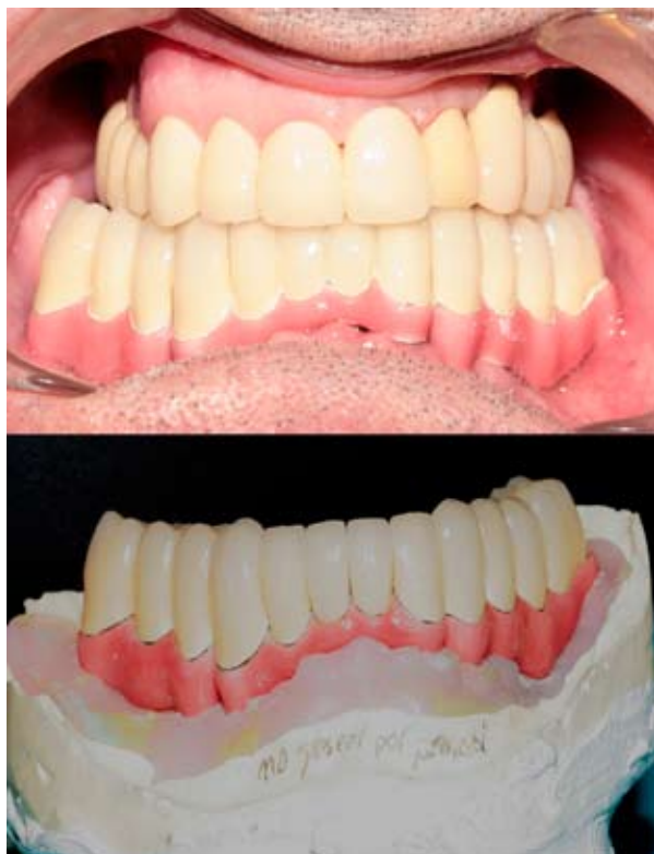
Fig. 2. Porcelain fused to metal individual crowns placed on the mesostructure in the dental working cast and after the provisional cementation in mouth.

through functional mandibular retrusion, thus gaining a better aesthetic aspect. The end result provided an adequate contour to facilitate maintenance and healthy gum tissue.