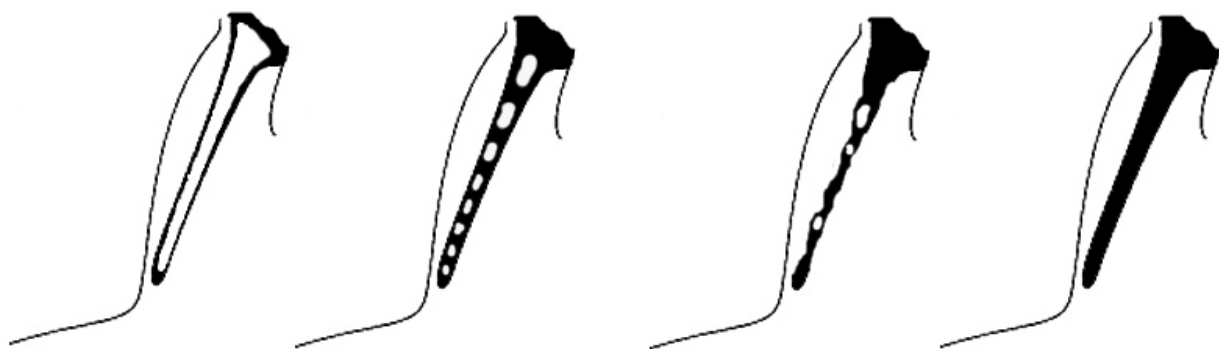
Fig. 3. Schematic representation of calcification patterns of styloid process.