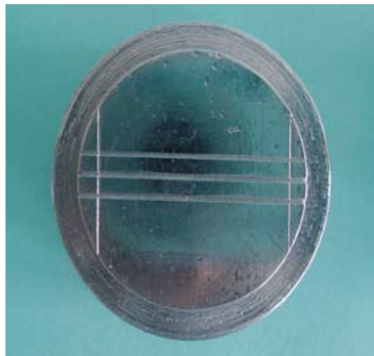
Fig. 1. Surface of the metal die.

Four standardized stainless steel dies (as described in ADA specification No. 19) were used for the study. The dies were fabricated at Bapuji Institute of Engineering and Technology. The surface of each die was having following specifications (Fig. 1).