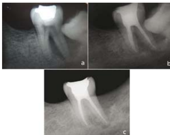
Fig. 2. a) Initial radiograph of tooth #37. b) Final radiograph after obturation of the root canals. c) A year recall radiograph showing complete healing of the bone lesion.

A 42-year-old male patient, whose medical history was noncontributory, came to our department with a history of acute pain and localized swelling in the left mandibular molar area. Radiographic examination presented severe bone loss around the distal root of tooth #37 (Fig. 2). The cause of the bone loss was considered related to the uncleaning space between second and third molar. The rest of the dentition had normal periodontal values. The tooth #37 was nonresponsive to vitality tests. After completion of root canal treatment, the patient was referred for extraction of the third molar tooth (Fig. 2). At the 6 month recall visit, the complete repair of the bony lesion was observed (Fig. 2).