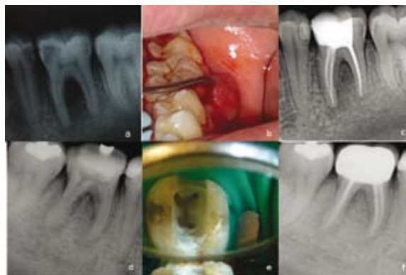
Fig. 1. Case 1- a) Initial radiograph of tooth #36. b) Intraoral film showing increased probing depth values in the furcation area. c) A year recall radiograph showing complete healing. Case 2- d) Initial radiograph showing increased bone lesion in the furcation and distal side of the tooth #46. e) Access opening showing mesio-distal crack line in the pulp floor. f) A year recall radiograph showing healing of the bone lesion.

pair of lesion was observed and the tooth was asymptomatic (Fig. 1).