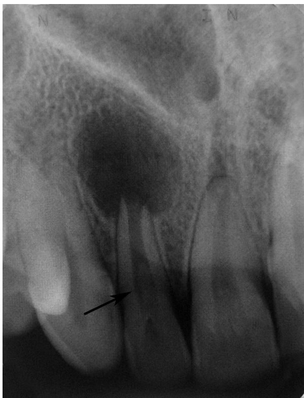
Fig. 3. Maxillary right lateral incisor with periapical lesion affected by Type III dens invaginatus (arrow).

All radiographs were reviewed in a dark room with an x-ray viewer (Illuminator 5000; RP Beard Ltd, London, UK) and evaluated independently by two examiners. A separate assessment of the radiographs was performed by each examiner, and the types of dens invaginatus were agreed upon according to the suggestions of the more experienced investigator. A final evaluation was performed, and a collective decision was made to determine whether or not the tooth had dens invaginatus and the type.