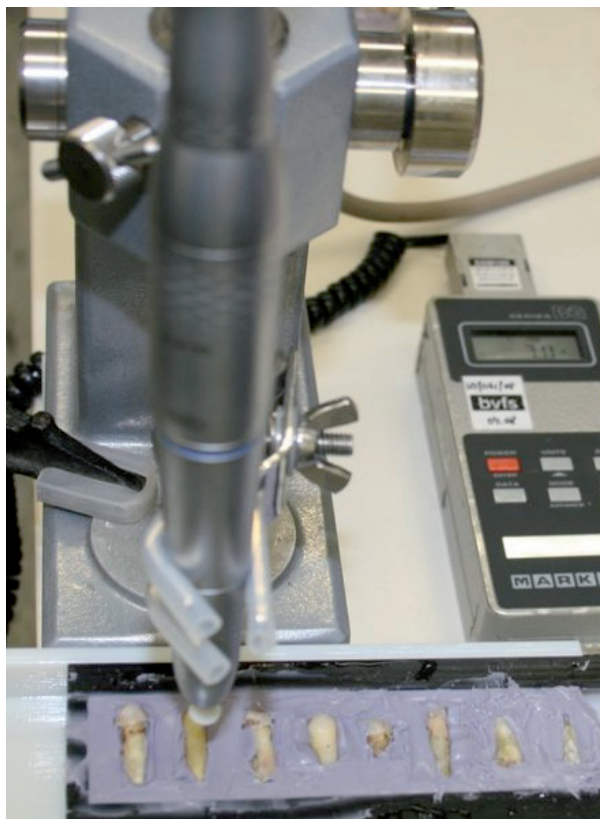
Fig. 1. Teeth embedded in a silicone model with a built-in water reservoir. IOA system hand-piece fixed at a 90° angle to the intended line of perforation, using the specially designed splint with a pressure-calibrated support plate.

substances were perforated without the application of any additional external coolant to simulate the intraosseous situation.