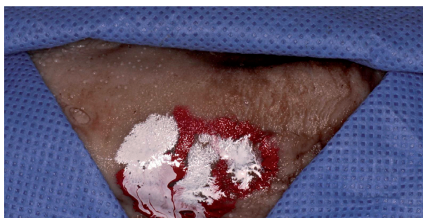
Fig. 1. Lesion framed by a fenestrated surgical drape.

The participants had to perform an incisional biopsy on the non-homogeneous lesion with the aid of a traction stitch (Fig. 2) choosing the most representative region