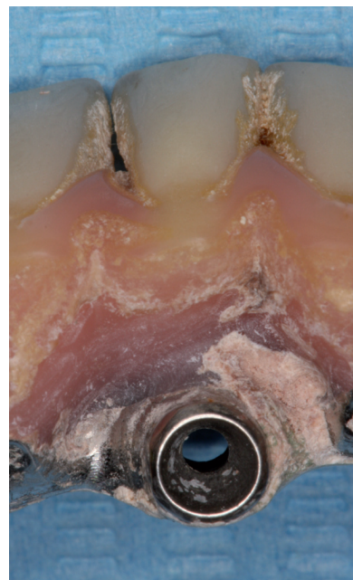
Fig. 3. Prosthesis in which a large quantity of retained calculus can be observed in a patient who did not receive maintenance therapy.

The mean plaque index was 39.98% [17-90]. The mean plaque index was 20.34% [17-24] in the SPT group and 59.63% [38-90] in the No SPT group, with a statistically significant correlation with respect to bone loss around their fixtures during the first year ( p=1.59 \times 10^{-8} ). (Table 1).