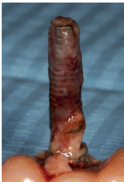
Fig. 2. Failed implant in a patient who did not receive supportive periodontal therapy.

One implant was lost during this year (Figs. 2,3), rendering a total survival rate of 99.59% (100% for SPT and 99.18% for No SPT). Six patients (12%) presented typical signs of periimplantitis in at least one fixture, five in the No SPT group (22.7%) and one in the SPT group (3.7%). Furthermore, it was observed that sixteen patients (32%) presented an implant with signs of mucositis, eleven in the No SPT group (50%) and five in the SPT group (18.5%).