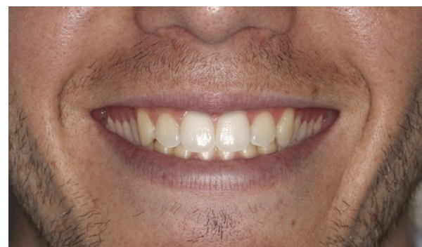
Fig. 2. Photo of smile modified to create 6 mm of posterior gum exposure.