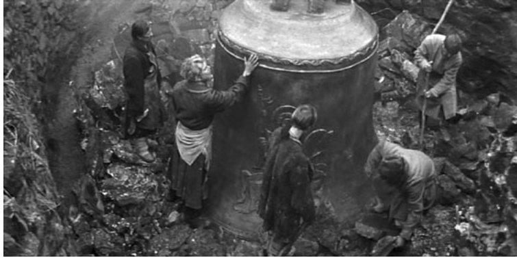
Illustration 1: The young bell maker and his companions.

seems to know much more about local customs, people and events than the other Italian.