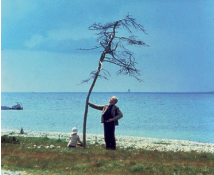
Illustration 12: Alexander and Little Man planting the barren tree.