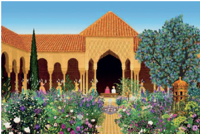
Illustration 6: Jenane's garden.

According to Jenane, Crapoux can only have lied to Azur and told him nasty things about the country, so Azur also lives a miserable life of failure like himself. On the other hand, it is revealed that Crapoux has blue eyes, which he hides behind thick eyeglasses because of the superstition of the locals. He will continue to hide his eyes because life in the streets is not the same as