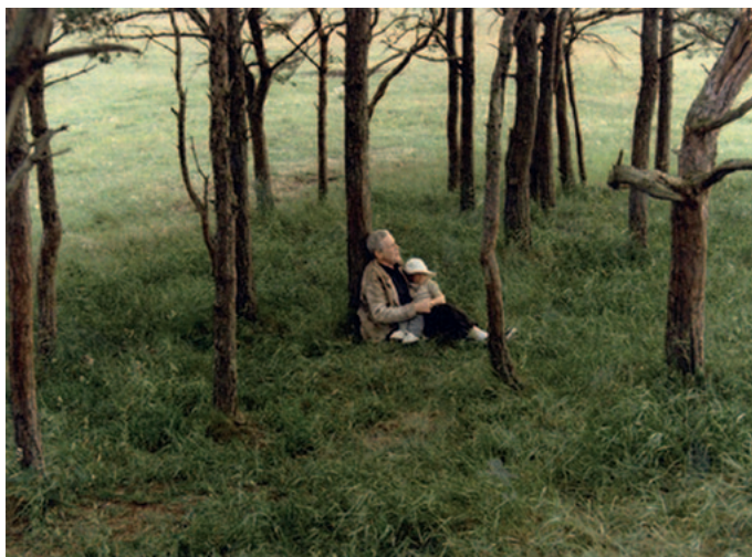
Illustration 8: Words, words, words.

Multilingualism is present right from the start in Andrei Tarkovsky's last film. Two titles, Offret and Sacrificatio , are displayed simultaneously on Leonardo Da Vinci's "Adoration of the Magi", on the background of music by Johann Sebastian Bach. But mistrust of human language is also expressed very early in the film, in the form of a quotation from Hamlet : "Words, words, words". Hamlet gives this reply to Polonius, who wanted to know what the prince was reading. In Offret , whose English title is The Sacrifice , it is Alexander (Erland Josephson) who says this, in one of his monologues, as he wanders around accompanied by his mute son. Alexander speaks a lot, and the child listens.