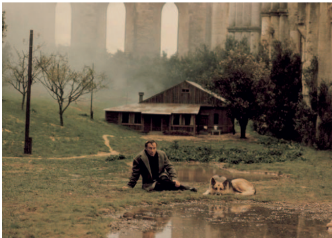
Illustration 10: The ending shot of Nostalgia .

Nostalgia is about exile, and was made in exile. A Russian poet, Gorchakov (Oleg Yankovsky), travels through Italy, accompanied by his guide and translator Eugenia, researching the life of an 18 th century Russian composer. They arrive in a small spa town, said to have been a favourite place of saint Catherine of Sienna, and go to the hotel.