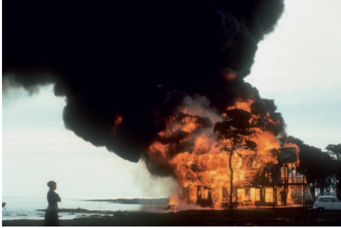
Illustration 9: Leaving everything behind.

Nostalgia is about exile, and was made in exile. A Russian poet, Gorchakov (Oleg Yankovsky), travels through Italy, accompanied by his guide and translator Eugenia, researching the life of an 18 th century Russian composer. They arrive in a small spa town, said to have been a favourite place of saint Catherine of Sienna, and go to the hotel.