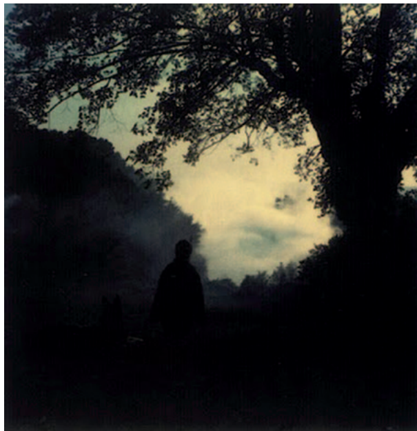
Illustration 7: Detail from a Tarkovsky film.

Nostalghia in Italy and Offret in Sweden. If Bird (2004) was right to claim, with respect to Andrei Rubliov , that the entire film is about what cannot be shown, the same statement can probably be made about poetry, and about all of Tarkovsky's work.