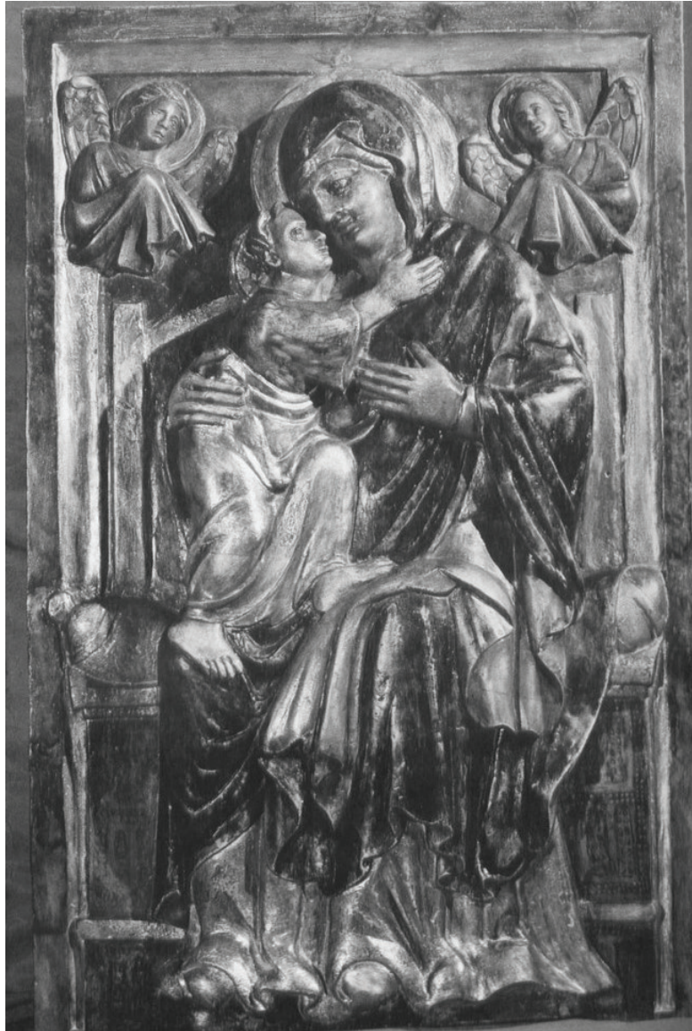
Ill. 111 – Valencia, El Puig de Santa María, Monastery of Santa María del Puig, Madonna with Child, Relief Icon, second half of the 13th century Italian sculptor.