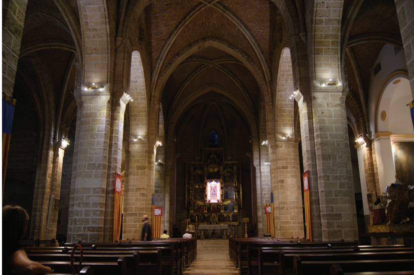
Ill. 109 – Valencia, El Puig de Santa María, Monastery of Santa María del Puig, 13th–18th centuries.