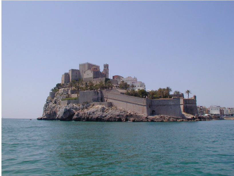
Ill. 104 – Peñíscola (Castellón), the castle and the medieval city.