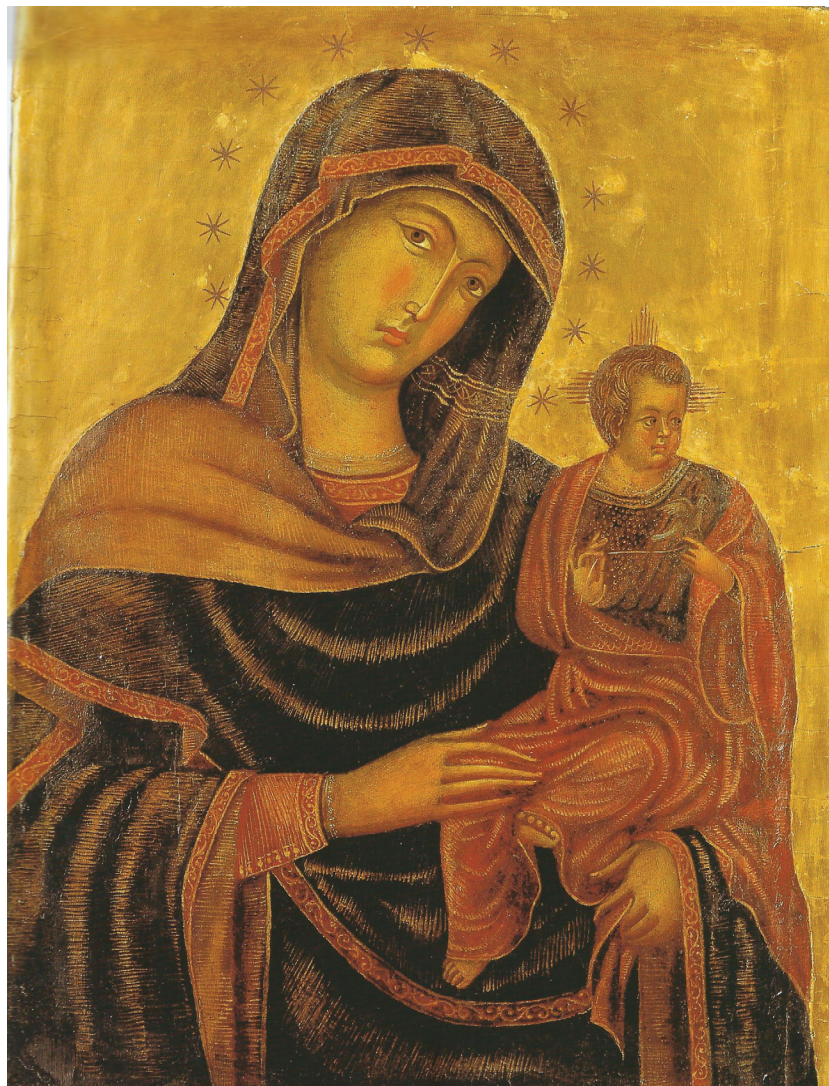
Ill. 108 – Italian painter, Our Lady of Grace ( Nuestra Señora de Gracia ), ca. 1270–1300, Valencia, Saint Augustine’s parish church.