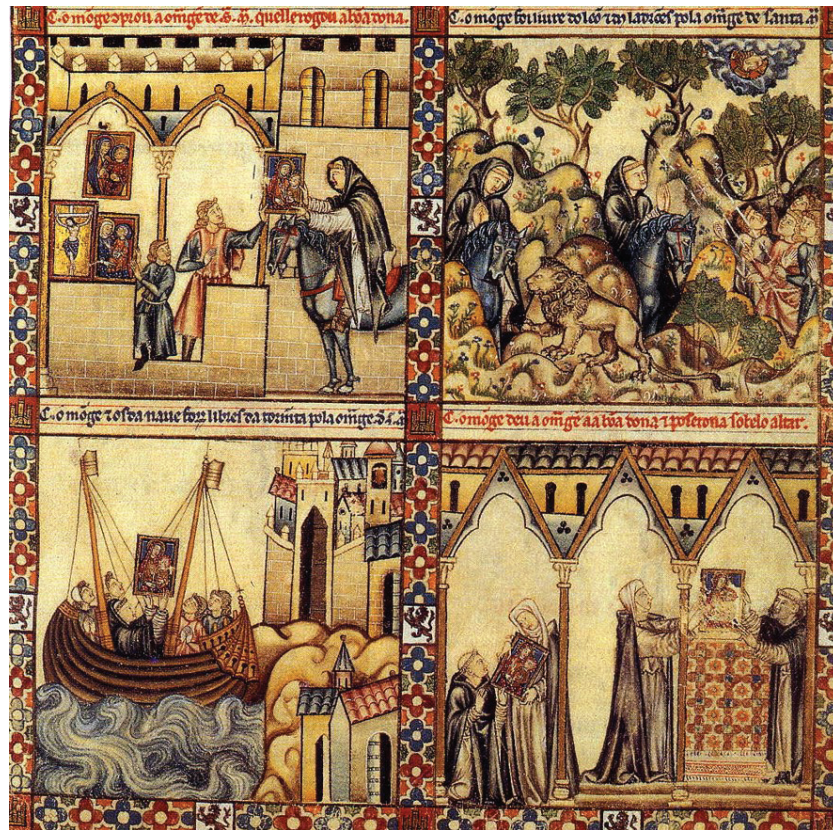
Ill. 103 – Illuminator of Alfonso's X workshop, Miniature of Cantigas de Santa María, Rich Codex, ca. 1272–1284, San Lorenzo de El Escorial, Biblioteca del Real Monasterio, T-I-1, cantiga 9, f. 17r (Patrimonio Nacional).