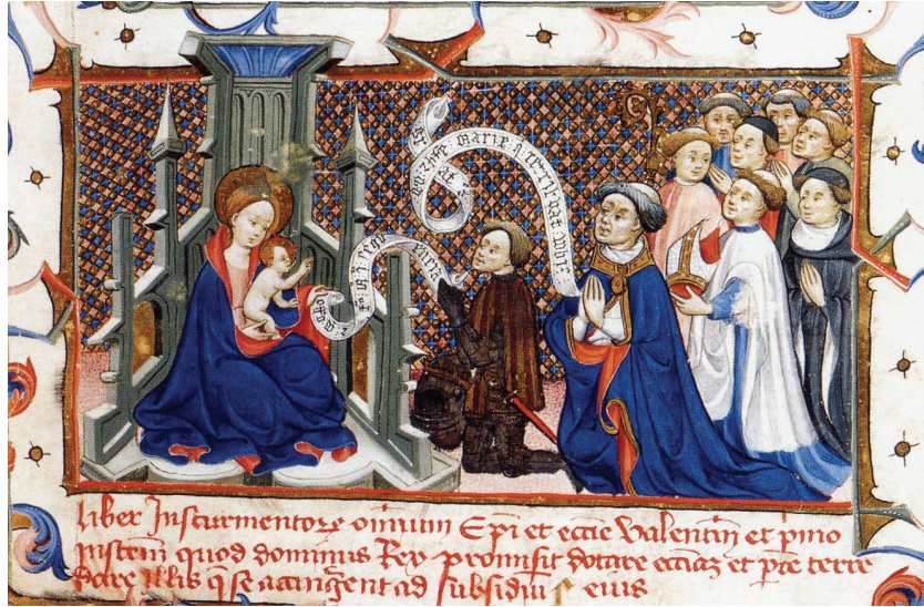
Ill. 106 – Liber Instrumentorum Master (Domingo Adzuara?), Miniature of King James I and the Bishop of Valencia offering the foundation of the new Cathedral to Saint Mary, Valencia, Cathedral, Biblioteca Capitular, ms. 162, f. 6r.