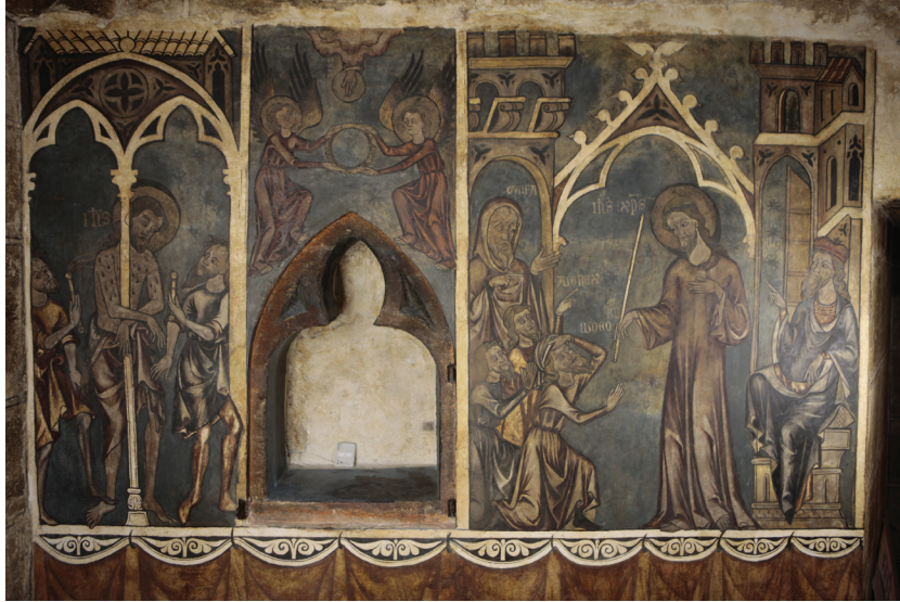
Ill. 107 – Painter from the Crown of Aragon, Wall paintings with scenes of Christ's Passion, ca. 1256–1280, Cathedral, secret chamber ( reconditorio ), (Image courtesy of Subdirección de Conservación, Restauración e Investigación IVC+R [Culturarts], Generalitat Valenciana.