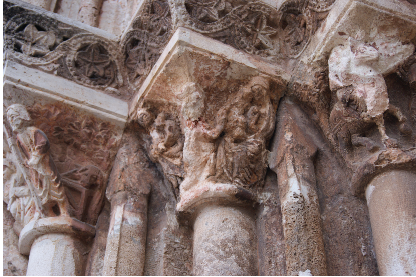
Ill. 110 – Valencia, El Puig de Santa María, Capital on the portal of the church of Saint Mary, 13th century, Sculpture workshop from the Crown of Aragon.