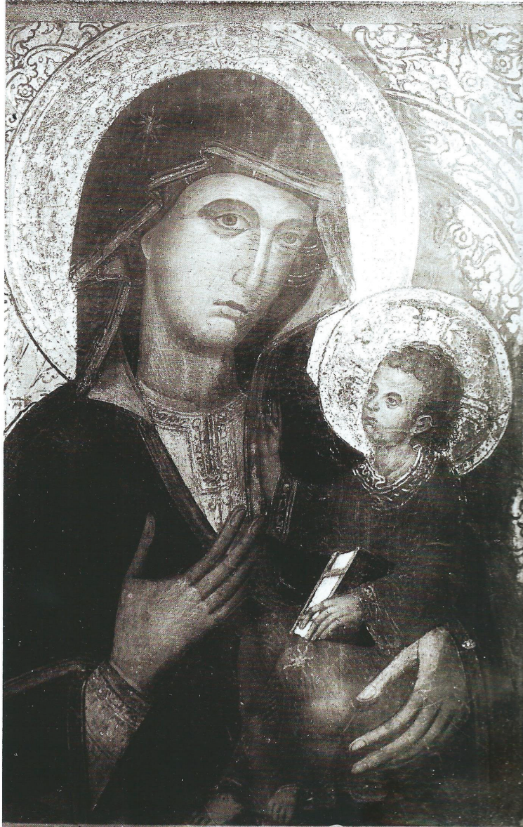
Ill. 105 – Mediterranean painter, Our Lady of the See ( Nuestra Señora de la Seo ), Icon, 13 th century, Valencia, Cathedral (before 1936).