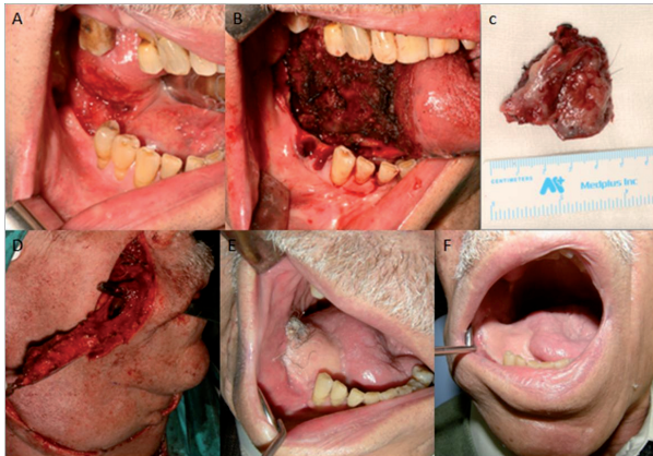
Fig. 1. A) Ulcerative lesion in right glosso-mandibular sulcus and right lateral lingual border. B) Intraoperative image after intraoral resection of the lesion with wide margins. C) Surgical specimen. D) Intraoperative image showing nasolabial flap design. Transbuccal tunnel allows the flap to be transferred into the intraoral cavity. E, F) Postoperative images before and after radiotherapy treatment.

tunneled, de-epithelialized and sutured in its final position as a single-stage procedure. All traces of intraoral hair disappeared following the patient's postoperative radiotherapy, which resulted in a satisfactory aesthetic outcome (Fig. 1). At present the patient is still being followed up and shows no signs of relapse.