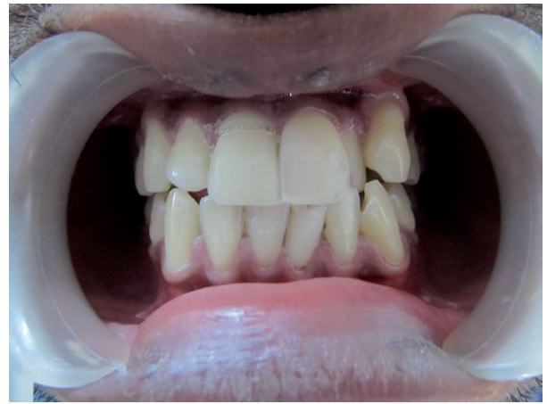
Fig. 5. Preoperative Case 2.