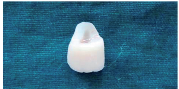
Fig. 6. Retrieved Fractured Fragment Case 2.