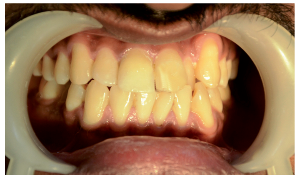
Fig. 7. Postoperative Case 2.