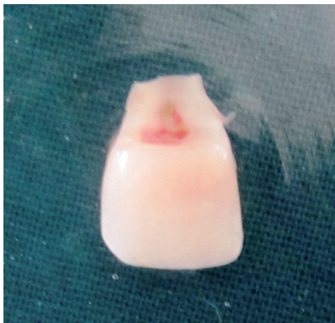
Fig. 3. Retrieved Fractured Fragment Case 1.