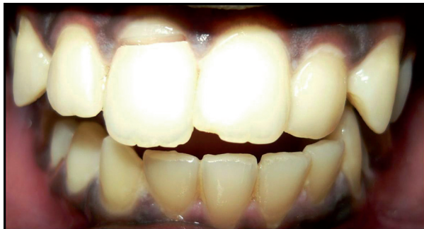
Fig. 2. Preoperative Case 1.

a large round bur to act as a retentive area and to receive the post. The alignment of the coronal fragment was assessed with the post in position. The root canal was then etched using 37% phosphoric acid for 15 seconds and thoroughly rinsed off. Bonding agent (ADPER SINGLE BOND2, 3M ESPE) was then applied to the root canal walls and light-cured for 15 seconds. Bonding agent was also applied to the light transmitting post. Dual cure resin (Rely-X, 3M) was placed in the canal and the fiber post was placed up to the proper length. The inner surface of the coronal fragment was similarly etched and bonded to the tooth with dual cure resin composite. When the original position had been reestablished, excess resin was removed and the area was light cured for 40 seconds on each surface, making sure that no displacement of the fragment occurred before adhesive/resin polymerization was complete. The margins were properly finished with diamond burs and polished with a series of Sof-Lex disks (3M ESPE) and diamond polishing paste. The occlusion was carefully checked and adjusted. Instructions were given as to avoid heavy forces on these teeth to both patients and to follow regular oral hygiene practices. The patients returned for 1, 6, 12 and 18-month follow-ups, and restorative treatments remained clinically and aesthetically acceptable for the entire time (Figs. 2-7).