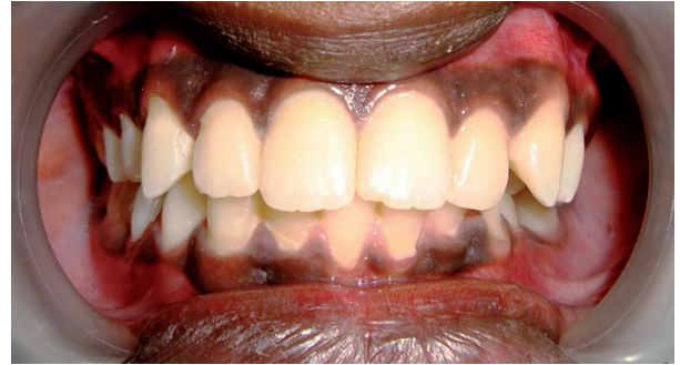
Fig. 4. Post operative Case 1.