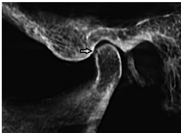
Fig. 1. CBCT image shows sagittal view of an erosive lesion on condylar head.

The CBCT images were obtained with Cranex 3D (Soredex, Helsinki, Finland), 90 kVp, 8 mA, scan time 6.1s and field of view 61×78mm (Figs.1,2). Panoramic and spiral tomography images were acquired with the Cranex tom (Soredex, Helsinki, Finland) dental panoramic