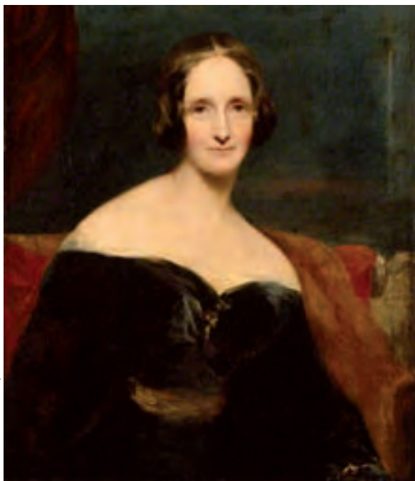
National Portrait Gallery, London

Richard Rothwell. Mary Wollstonecraft Shelley , 1840. Oil on board, 61 × 73.7 cm. Some consider Mary Shelley's Frankenstein (1818) to be a forerunner of science fiction. In this novel scientific progress, related to the generation of life, is cast as a monster that turns against its creator.