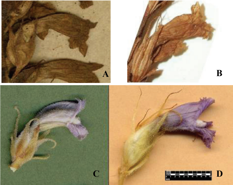
Fig. 5.- Lateral views of calyx and corolla. A. close-up of the type of Phelipanche cernua (see fig. 1). B. close-up of the type of Phelipanche schultzei : Annaba, Algeria [herb. Mutel, MHNGr. 1849 (GRM)]. C. Ph. cernua from San Martín de Ubierna (Burgos, Spain) 42° 28' 39'' N 3° 41' 38'' W, 918 m, parasitic on Lactuca viminea (L.) J. & C. Presl in limestone and grassy slopes, Ó. Sánchez Pedraja & M. Tapia Bon SP0035/2007, 23-VI- 2007 (herb. Sánchez Pedraja 12919). D. Ph. schultzei from the bed of the stream Breña (near Alhaurín de la Torre, Málaga, Spain), 36° 38' 53'' N 4° 10,67 m 41'' W, 250 m, parasitic on Distichoselinum tenuifolium (Lag.) García Martín & Silvestre, G. Gómez Casares & G. Moreno Moral MM0060/2004, 12-IV-2004 (herb. Sánchez Pedraja 11774). The graphic scale is strictly referable only to the two lower pictures.