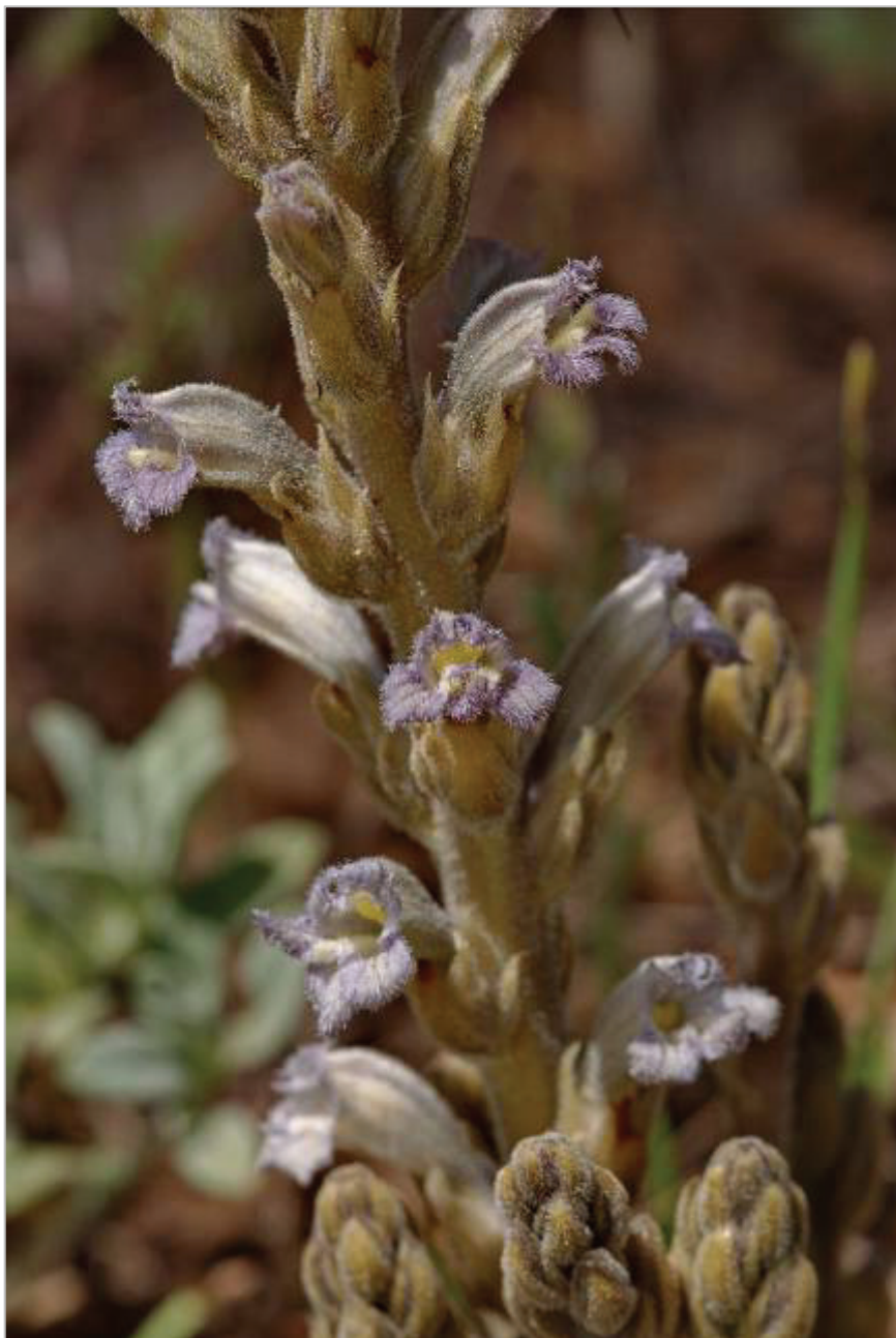
Fig. 3.- Phelipanche cernua Pomel: Morocco, Region of Meknès-Tafilalet, province of Khénifra, 32° 58' 09,60'' N 5° 03' 30,70'' W, 3 km south of the Col du Zad –near Ait Oufella–, Cedrus atlantica woodland, 1960 m, 12-VI-2011, J. Quiles Hoyo phot.