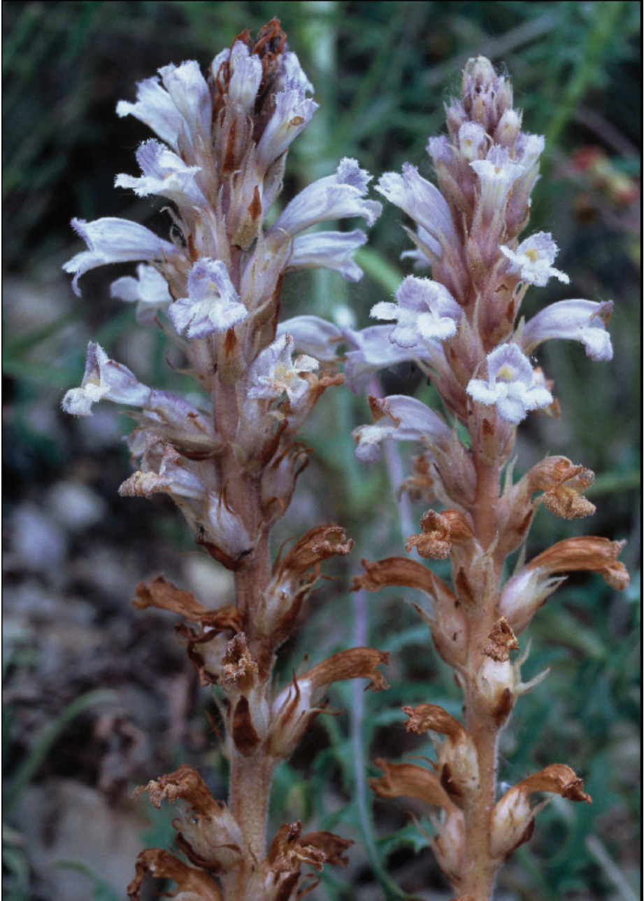
Fig. 4.- Phelipanche cernua Pomel. Photograph in vivo of the plants in the fig. 2, by G. Moreno Moral.