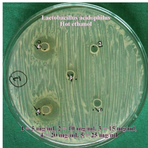
Fig. 4. Phytochemical analysis of orange peel extract.

alkaloids, carbohydrates and glycosides, tannins and phenolics, saponins and flavonoids. Triterpenoids were only present in ethanolic extract.