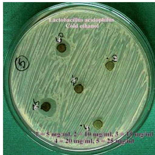
Fig. 3. Minimum Inhibitory Concentration (MIC) of Citrus sinensis peel extracts against dental caries pathogens on specific media for each microorganism.