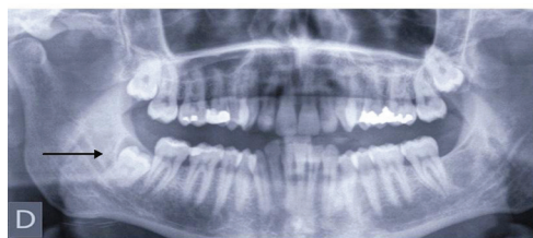
Fig. 1. Panoramic radiograph showing an impacted lower third molar completely covered in bone, the tooth indicated for extraction in the case described in the survey.

Lastly, the questionnaire contained similar questions