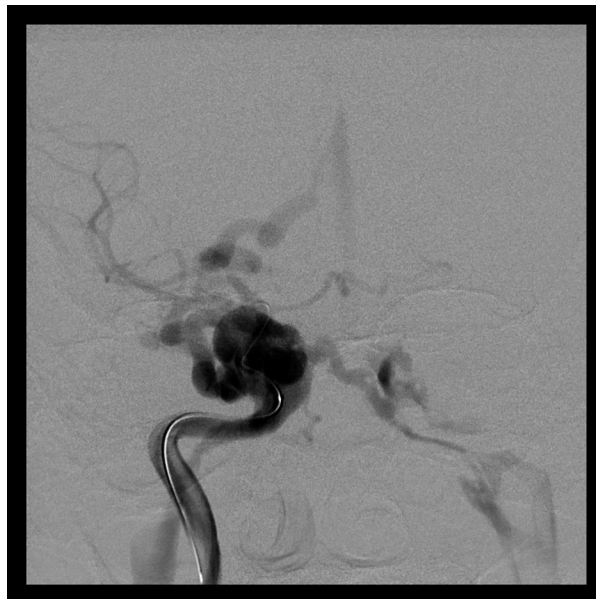
Fig. 1. AP head arteriography. CCF before treatment with endovascular approach.

After evaluating the case, Neuroradiologists decided to carry out a bilateral arteriography of the head. This test also proved the existence of a direct posttraumatic CCF. In addition, this test also showed that the fistula presented high blood flow, with significant impact on intracranial hemodynamics (Fig. 1). Against this backdrop, neuroradiologists decided to treat the patient with endovascular approach. More in detail, they carried out a right cavernous sinus embolization with arterial access. In fact, through Seldinger technique (femoral approach) they performed the embolization of the lesion using 12 endovascular coils. In this sense, we would like to stress that the surgery was highly successful (Figs. 2,3). In fact, chemosis and pulsating exophthalmos of the right eye completely disappeared after surgery. Moreover, the patient referred improvement of visual acuity. Importantly, we also want to emphasise that the patient remained asymptomatic after 9 years of clinical monitoring.