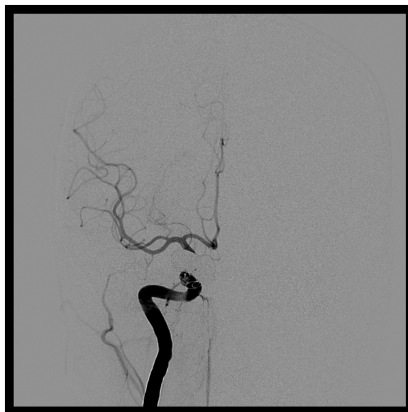
Fig. 2. AP head arteriography. CCF after treatment with endovascular approach.