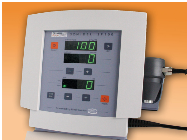
Fig. 2. Sonoporation.

which drive the microparticles suspension containing microencapsulated drugs through the porous membrane and the formed pores into the skin area. Now a day, the sonoporation devices (Fig.2) are commercially available by various companies. (Sonidel Limited MEMS, Texas Scientific Instruments, US). The normal ultrasound device can be used with certain kinds of probes. The probes are based on type of functions like nuclear transfer, cell fusion, tooth germ, tissues etc.