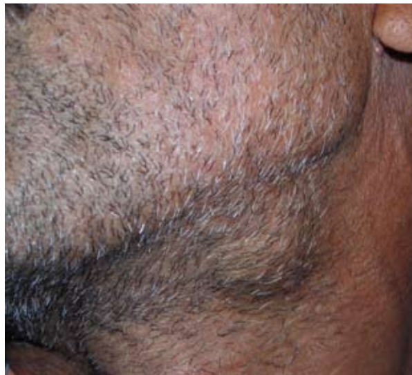
Fig. 1. A well defined hard and tender swelling in the left submandibular region

A 45 year old male noticed a swelling in the submandibular region for the last 18 months. He reported to department of Oral Pathology and Microbiology one year