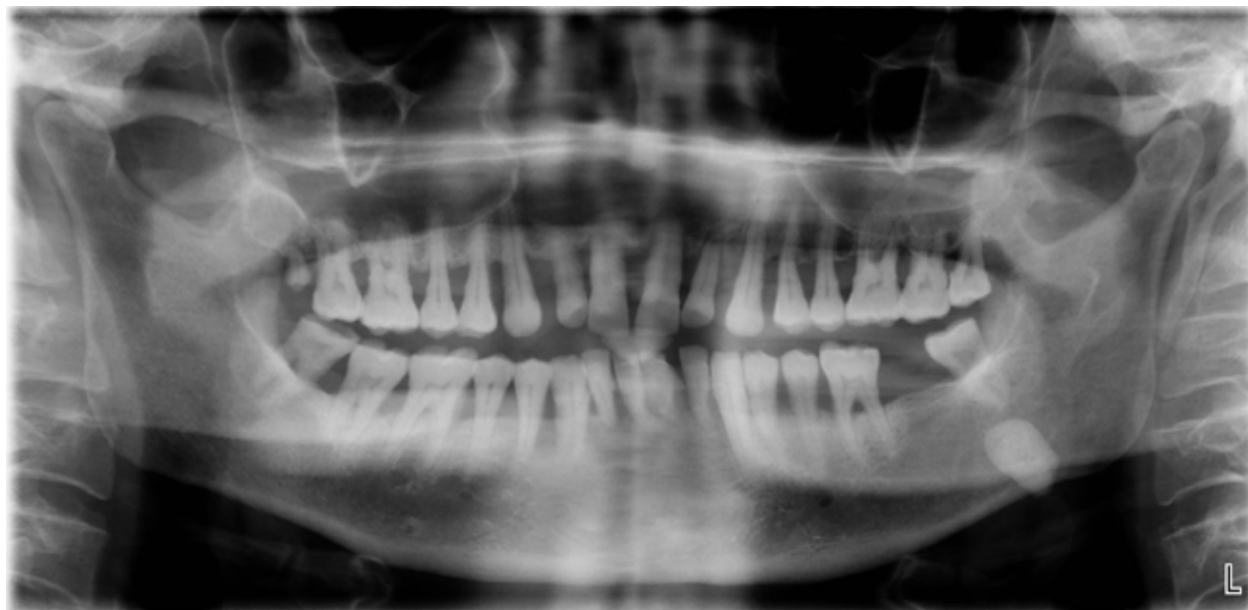
Fig. 2. OPG showing a well defined radiopaque mass on the left lower border of the mandible.

back with the same problem and was diagnosed sialolith in relation to left submandibular gland but did not report for further treatment. Presently patient has moderate to severe pain which increase during mealtimes and swelling in the same region with an occasional feeling of numbness. He had undergone extraction of lower left second molar two years back. A hard and tender swelling in the left submandibular region of approximately 1 x 1.5 cm was palpated (Figure 1). Intra oral examination revealed scanty salivary flow from the duct of the left submandibular gland. The medical, social and family histories were unremarkable. A complete blood investigation revealed no abnormal finding. The orthopantomogram revealed a well defined radiopaque mass on the left lower border of the mandible (Figure 2). The