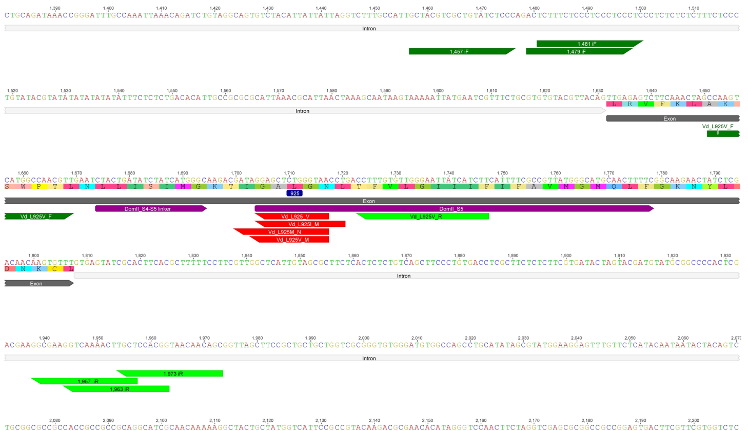
Fig 1. Intron-exon-intron section of the V. destructor VGSC Domain II. Section including the linker between transmembrane segments 4 and 5 (DomII_S4-S5) and the transmembrane segment 5 (IIS5) [in magenta]. Intron [light grey] and exon regions [dark grey], as well as the annealing positions for primers [green] and TaqMan® probes [red] are shown. Numbering corresponds to that in Accession KC152655. The position of the residue 925 of the channel protein is highlighted in blue.

Genomic DNA from at least 2 individuals per sample was used as a template to PCR-amplify fragments covering the relevant region of domain II (Fig 1) following a two-step nested PCR strategy [27]. For the primary amplification (PCR1), the primers were 1457iF (5'-GCTACGT CGCTGTATCTCCC-3') and 1973iR (5'-GCTGTTGTTACCGTGGAGCA-3') and for the secondary amplification (PCR2), the primers were 1479iF (5'-ACTCTTCTCCCTCCCTCCC-3') and 1963iR (5'-CCGTGGAGCAAGTTTTGACC-3'). For each amplification, the reaction mixture contained 0.4 μM of each primer, 15 μl of DreamTaq Green PCR Master Mix (2x) (Thermo Scientific), 12 μl of distilled water and 1 μl of genomic DNA (or PCR 1) to a final volume of 30 μl. Cycling conditions were: 94°C for 1 min followed by 35 cycles of 94°C for 20 s, 61°C for 20 s and 72°C for 45 s, and final extension at 72°C for 5 min. The PCR fragments were precipitated with ethanol and direct sequenced (Eurofins MWG Operon, Germany) using the primers 1481iF (5'-TCTTCTCCCTCCCTCCCTC-3') and 1957iR (5'-AGCAAGTTTTGA CCTTCGCC-3'). All primers were designed and the sequences analysed using Geneious software (Version 8.1, http://www.geneious.com/ ).