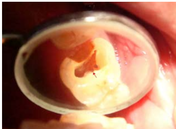
Fig. 2. Intra oral view showing the two distobuccal canals

After local anesthesia, a conventional endodontic access opening was made. While the access chamber was being explored with a DG 16 explorer (Maillefer, Dentsply), a catch was felt between the line joining the distobuccal and the palatal canals, more closely towards the distobuccal canal. The presence of an extra root/ root canal or a perforation was suspected (Fig. 2). A No 10 K file (Mani Inc, Japan) was placed in the suspected canal and a conventional radiograph was taken at different horizontal angulations (Fig. 1b). The instrument caused no bleeding or pain and reached a similar length as that of the distobuccal canal. Due to the overlap between the distobuccal canals and the superimposition of the anatomical structures on the distobuccal root, the radiograph proved inconclusive. Hence, to confirm whether the second canal was truly in the distobuccal root, a spiral CT was used. The patient was prescribed analgesics and discharged after sealing the cavity with a sterile cotton pellet and Caviton (GC Corporation Tokyo, Japan).