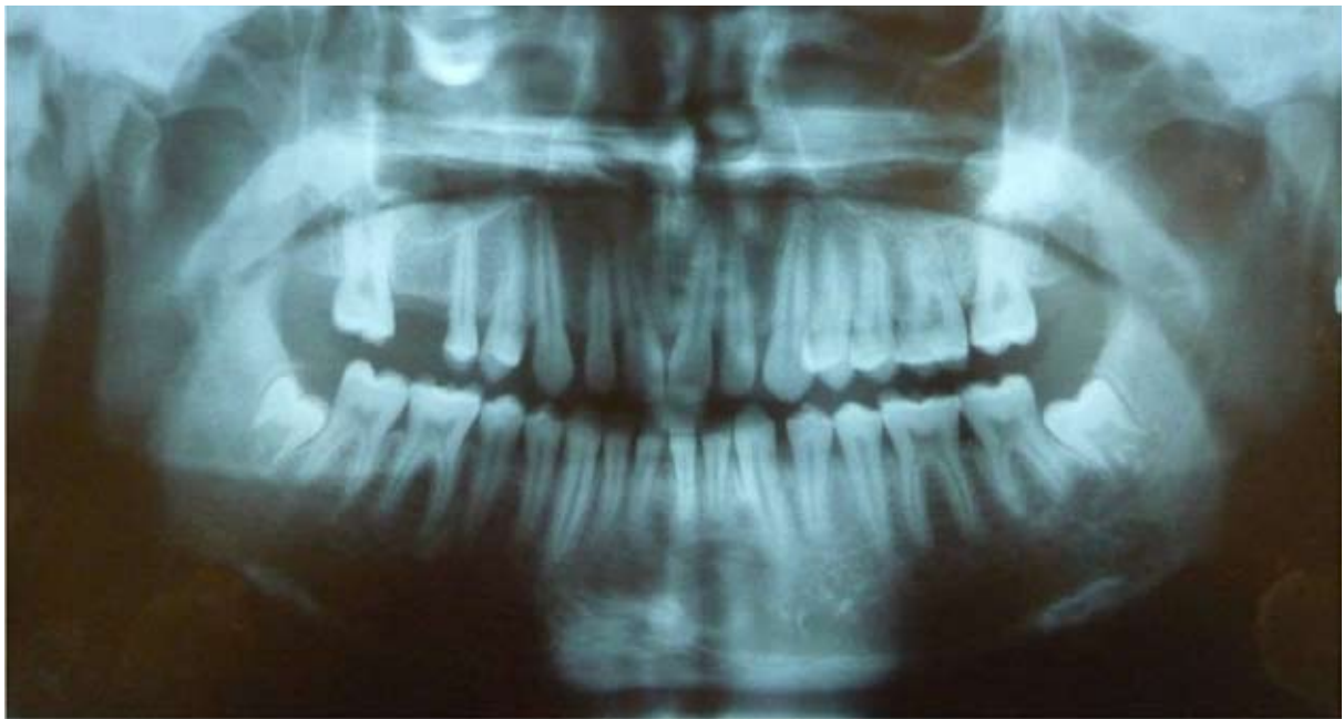
Fig. 1. Panoramic radiograph revealing an ill defined radiolucency corresponding to left second and third molars

An 18 year old male presented to our department with painless, diffuse swelling near left angle of mandible. No history of trauma, pain/mobility of teeth, parasthesia/anaesthesia or trismus was reported. Medical history was non contributory. Extraoral examination revealed a bony hard, non-tender, non-mobile swelling with normal overlying skin. There was no cervical lymphadenopathy. Intraoral examination revealed a roundish, hard mass close to lower left molar region. Associated teeth were firm and asymptomatic. Panoramic radiograph showed a mixed radiolucent-radio-opaque lesion in relation to left mandibular molars and submentovertex radiograph was significant for bucco-lingual expansion of lower border of mandible at left angle region (Fig. 1). Lateral oblique