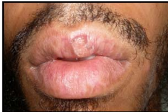
Fig. 1. Clinical photograph showing well-demarcated exophytic nodular growth located at the junction of vermilion border and the skin of upper lip.

Patient reported back after 2 months from his initial visit with no change in the size of the lesion, however, the lesion exhibited a yellowish white central zone of plug which was likely to be keratinous mass with raised edges. Subsequently the lesion was completely excised