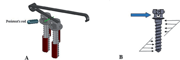
Fig. 3. A) Periotest Evaluation on STS. B) Force distribution by applying periotest's rod on a single miniscrew.

In the other hand, when we applied force to the single miniscrew system, statically, the force is resisted by a triangular distribution around the center of rotation. In application of single miniscrew, maximized reaction is produced in top and bottom of the miniscrew body,