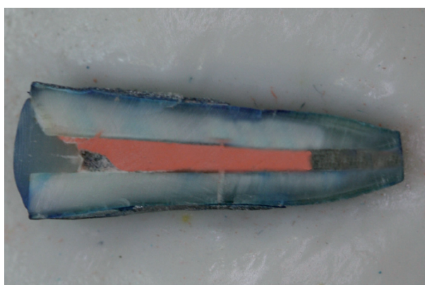
Fig. 2. Specimen with leakage grade 2.