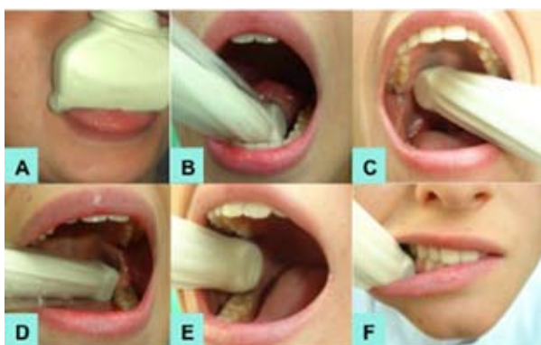
Fig. 2. Intraoral technique used for the assessment of: A- deep lingual a., B- sublingual a., C- greater palatine a., D- inferior alveolar a., E- buccal a., F- mental a.

repetition frequency and the wall filter were regulated to avoid artifacts. Figures 1,2 demonstrate the assessment of arteries Doppler sonography.