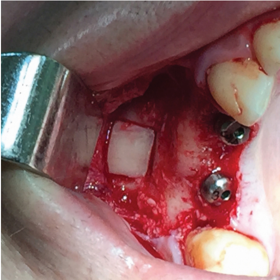
Fig. 1. Bony window repositioning after implants placement using bone reformation technique.

ined to verify that there was no tearing and the implants were placed, also with infra-preparation. Once fixed, the sinus membrane was placed over the implant and the formation of clotting within the sinus was checked. In most cases it was possible to stably replace the bony window (Fig. 1); a resorbable membrane (Bio-Gide®, Geistlich Biomaterials, Switzerland) was used when replacement was impossible.