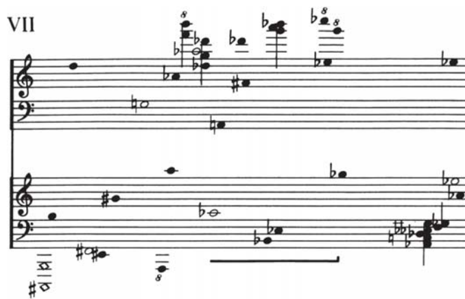
Fig. 5: Excerpt from Cage's "Étude Australe VII" for piano