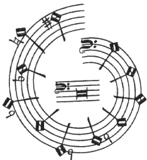
Fig. 1: The spiralling pentagram with the sequence of notes from the Series I by Paul Hindemith (from “The Craft of Musical Composition”)

Well-Tempered Clavier” by Bach, implementing his own theory where chords and intervals are chosen according to the laws of acoustic physics. This masterpiece is composed of twelve fugues 1 interposed with eleven interludes framed by a prelude ( Praeludium ) and a postlude ( Postludium ). Each fugue is based on one of the twelve semitones, but while Bach uses the chromatic order and Chopin, Busoni, Scriabin, and Shostakovich a series of fifths, Hindemith creates a sequence (called Series I ) that makes use of twelve pitches that withdraw step by step from a central note, which acts as a gravitational centre. In this way, Hindemith builds a sort of solar system, a C being the sun at the centre and all the other notes/planets orbiting around. In this sense, it is remarkable the illustration that he gives in the theoretical essay “The Craft of Musical Composition” where the pentagram containing the twelve semitones of the Series I warps in a spiral shape around the first note, a C, the central star. The notes of this succession increase their degree of dissonance while distancing from the first note (the C). The same happens in a planetary system, where the gravitational bound with the central star decreases for farther and farther planets. Finally, Hindemith employs a brilliant expedient to circumscribe the alternation of fugues and interludes without altering their symmetry. In fact, the Postludium is exactly the retrograde