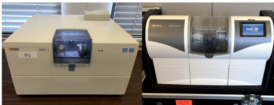
Fig. 1. Milling CAD/CAM units used in this study: Cerec 3 (left) and Cerec MXCL Premium Package (right).

A tri-dimensional (3D) model was then generated for each tooth; the adjacent teeth were digitally set in the virtual model axis and trimmed for proximal contact adjustments. Preparation margin was designed using the “automatic margin finder” tool followed by the insertion axis adjustment. The Cerec software then generated the 3D proposal restoration using the following software crown parameters: spacer= 100 \mu m; occlusal milling offset= 0 \mu m; proximal contact strength= 50 \mu m; occlusal contact strength= -75 \mu m; dynamic contact strength= 25 \mu m; minimal thickness (radial)= 0 \mu m; minimal thickness (occlusal)= 0 \mu m; margin thickness= 70 \mu m. After generating the 3D virtual restorations, scanned