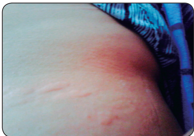
FIGURE 1 - Erythematous lesions in abdomen and indurated plaque in the left axilla and lateral side of the chest. Eight days after the beginning of treatment with benznidazole.

treatment with hydroxyzine (25mg at night-time), an extra dose of cetirizine (10mg after 12 hours if the pruritus was persistent), and prednisolone (30mg for 3 days, followed by a reduction of 10mg every 3 days over 9 days of treatment).