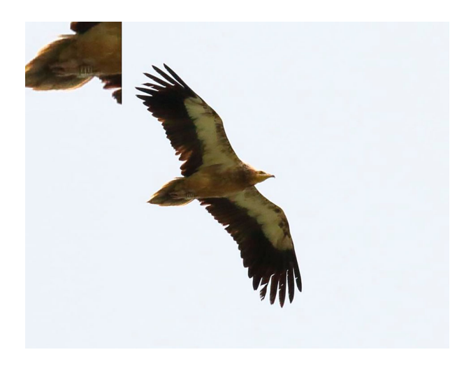
Figure 1. The Egyptian Vulture observed in Sicily. The ring code is zoomed upper left.

Christie 2001, Meyburg et al 2004). The common migration route of French and Spanish populations could facilitate the exchange of individuals between these areas (Meyburg et al 2004).