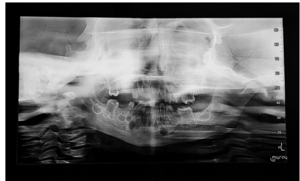
Fig. 2. Panoramic radiograph showing taurodontic teeth and thickened cortical bone.

Lateral cephalogram (Fig. 3) examination showed increased density of the mandible (especially the symphysis region) and the base of the skull. Frontal sinus pneumatization was not very apparent. Cephalometric analysis revealed a Class III skeletal pattern because of a retrusive maxilla (reduced SNA).