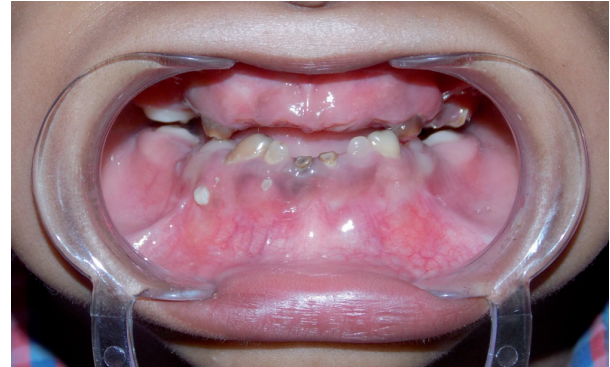
Fig. 1. Intra-oral view showing severely attrited teeth, visible pulp chambers and class III anterior occlusal relationship.

placed apically. Radiographic contrast between enamel and dentin was reduced. As root formation of the first permanent molars was not complete, an objective assessment of taurodontism was not done.