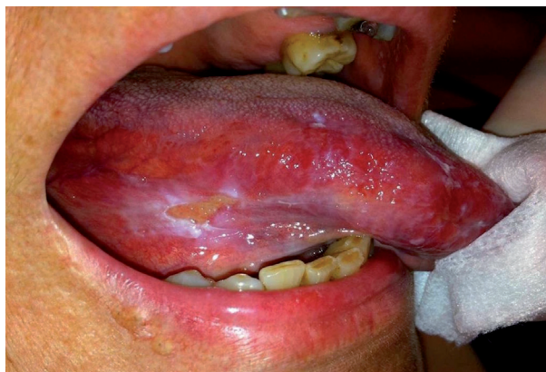
Fig. 1. Irregularly shaped ulcer covered by fibrinopurulent membrane and partly surrounded by a firmly attached white plaque on the ventral surface of the right side of the tongue. Notice small, white epithelial shreds around the lesion.

Clinical examination revealed an irregularly shaped ulcer covered by fibrinopurulent membrane and partly surrounded by a firmly attached white plaque on the ventral surface of the right side of the tongue (Fig. 1). The