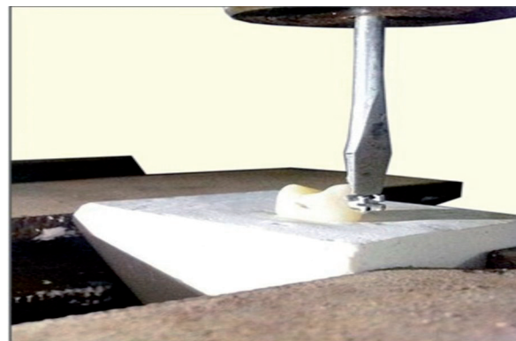
Fig. 3: Customized jig producing shear force at the bracket-tooth interface.