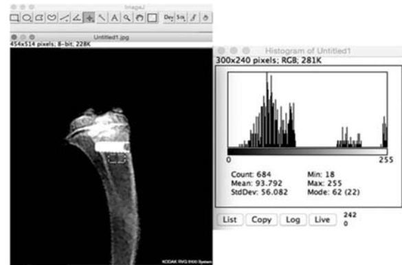
Fig. 2. Radiological view and radiodensitometric analysis of the micro-implant.

areas of equal width that were selected from the medullary bone areas that were adjacent to implant’s apical 3 grooves. The software’s histogram property, which expresses the light distribution of the digital image in one graph, was used to obtain the mean BMD values of each sample (Fig. 2).