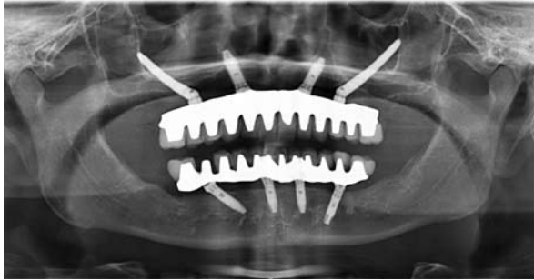
Fig.1. Panoramic radiograph of implants anchored in the zygomatic bone.