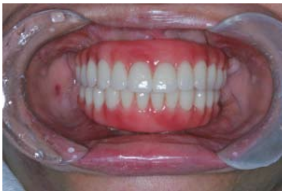
Fig. 3. Rehabilitation pattern with at least 6 months of zygomatic implants

BR1 apparatus (Data Hominis Ltd., Uberlandia, MG, Brazil) attached to a laptop, with 12-channels, including eight channels for EMG (active and passive electrodes) and four auxiliary channels. Surface active differential electrodes (two 10 mm-long x 2 mm-wide silver chloride bars 10 mm apart) with input impedance of 1010 \Omega /6 pf, bias current input of \pm 2 nA, common-mode rejection ratio of 110 dB at 60 Hz and gain equal to 20x were used in the study.