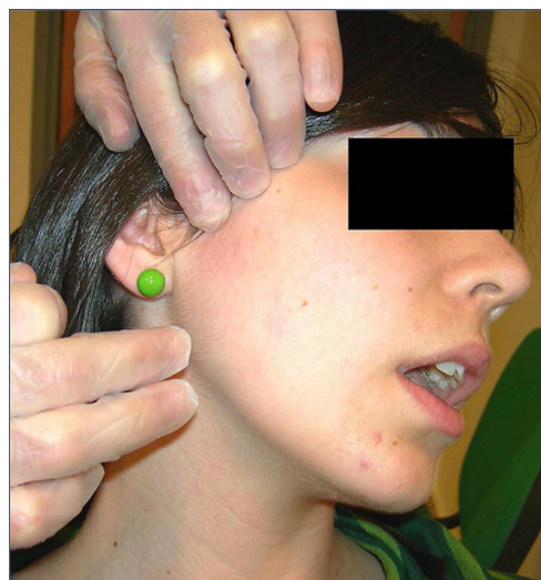
Fig. 1. Anatomic location of the external pterygoid muscle for needling.

assessments at 2 weeks, 1 month, 2 months and 6 months after finishing the treatment. The needle was applied after asepsis of the preauricular area with alcohol 90%, manual location of the intra-extraoral mass of the external pterygoid muscle (Fig. 1), uni- or bilaterally, and intramuscular needling (Fig. 2), according to the technique of Koole et al. modified without electromyographic control (10), followed by compressive hemostasis for 1 minute. The needle was inserted perpendicularly through the skin taking into account the relationship between the muscle and TPs with the surrounding anatomical structures. That is why we considered necessary to know the exact location of the TP by palpation and pressure sensitivity, and by asking the patient to perform a maximum opening that allowed us