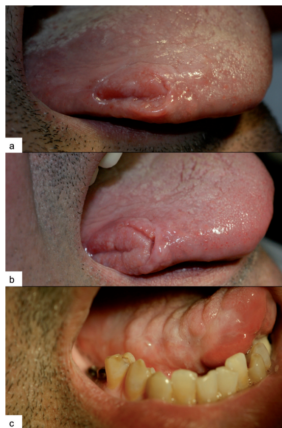
Fig. 1. Clinical case no.1. A) Appearance of the lesion at the time of diagnosis. B) Above lesion after 2 months. C) Appearance of the tongue 2 months after treatment.

tongue, which the patient attributes to self-traumatism. Slightly hardened edges are observed upon palpation of the lesion, and examination of the lymph nodes in the neck and in the superclavicular area is negative. The patient refuses to undergo a biopsy. The patient is scheduled to be seen for a follow-up 10 days later (after eliminating possible traumatic factors); however, the patient does not show up for his appointment. We feel that it is important to see the patient again, and therefore urge him several times to come in for a follow-up. The patient does not come in for a visit until February 22, 2009 (Fig. 1.B), and upon observing the persistence of the lesion with negative cervical palpation, the patient is sent to the emergency room at the Head and Neck Functional Unit of Bellvitge University Hospital (Barcelona, Spain). There, the patient undergoes a biopsy and is diagnosed with OSCC, performing a right hemiglossectomy and functional homolateral lymph node drainage on March 25 (Fig. 1.C). The surgical piece revealed clean edges of the wound and absence of lymph node affection. Therefore, the surgical team opted against additional treatment. At the 6-month follow-up (September 2009), there was no evidence of recurrence of the lesion and the PET-CT was negative. The next follow-up is scheduled in April 2010.