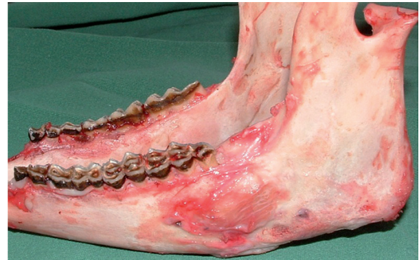
Fig. 3. Macroscopic analysis of mandible.

delay in bone healing in specimens submitted to LLLT during the latency/activation period.